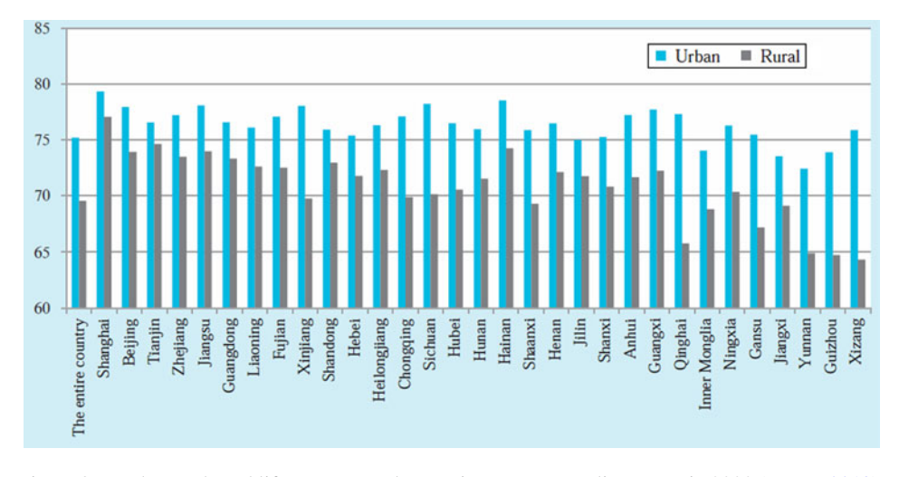
Figure 3. Urban and rural life expectancy by province or metropolitan areas in 2000 (UNDP 2013).

residents should be involved in the new rural co-operative medical care system generally'. The scheme promised from 2003 that: