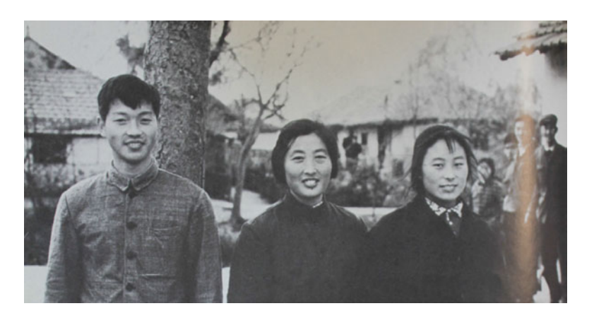
Appendix E. 'Three barefoot doctors', 1974

Appendix D. A picture of Mao Zedong in a clinic in Guanxi, 2012